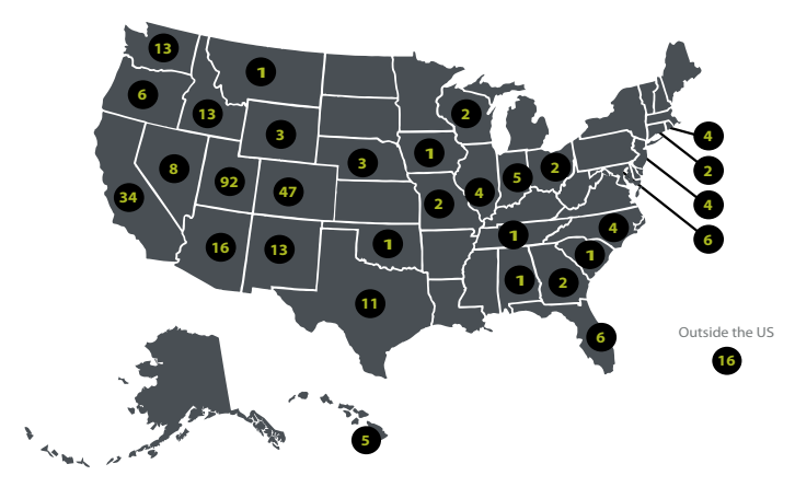
AQUA Group Project Sites

Over the years, we have worked on major design and engineering projects that have given us valuable experience with the processes and technologies necessary for completing work effectively and efficiently. We are honored by the trust and confidence our clients have in us and look to extend our track record of success in developing new facilities and in improving the performance of existing facilities for many years to come. On each and every project, we demonstrate our ability to provide excellent engineering services that make a difference for our clients and communities.